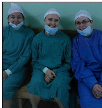
Oles in full garb after an experience in the Jalapa hospital operating room.

Jalapa change from a war-torn community and of seeing Nicaraguan friends' lives improve.