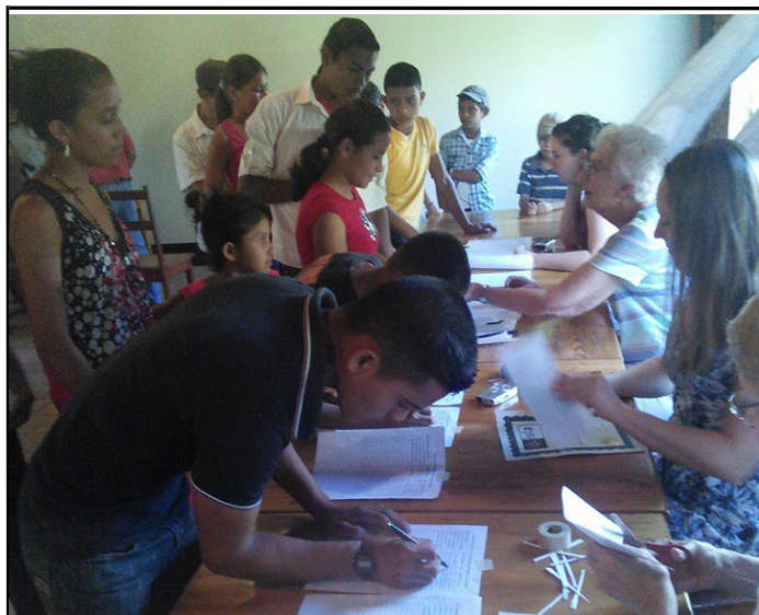
ISLA volunteers helped with January scholarship distribution to 85 deserving Jalapa students.

In July 2014, my 14-year-old daughter and I participated in the first-ever Family trip and it was great! We played games in Spanglish with young Jalapeños every morning at the Jalapa Library, helped to finish the hoop house garden at Casa Materna, and played soccer with a group from Casa Adolescencia. These explorations promise to add new dimensions to our relationship with Nicaragua.